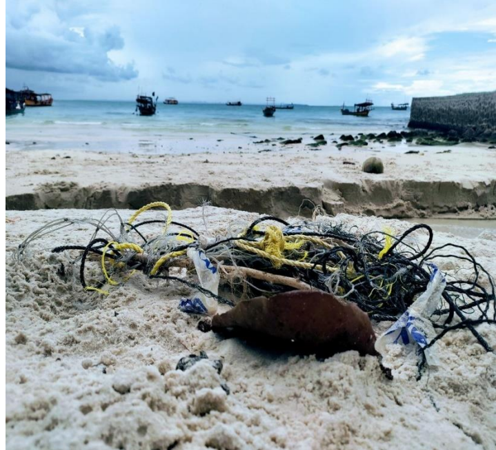
Presence of marine plastic pollution in Koh Touch, KRA (2022); credit: (left) Enrico Barilli / FFI; (right) Majel Kong / FFI

HHs unwilling to clean waste in both sites (94% in Koh Sdach, 14% in Koh Touch) similarly referred to their lack of experience doing it and the immediate-disposal habit as explanation for their unwillingness.