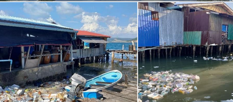
Presence of marine plastic pollution in Koh Sdach Archipelago (Feb 2022)